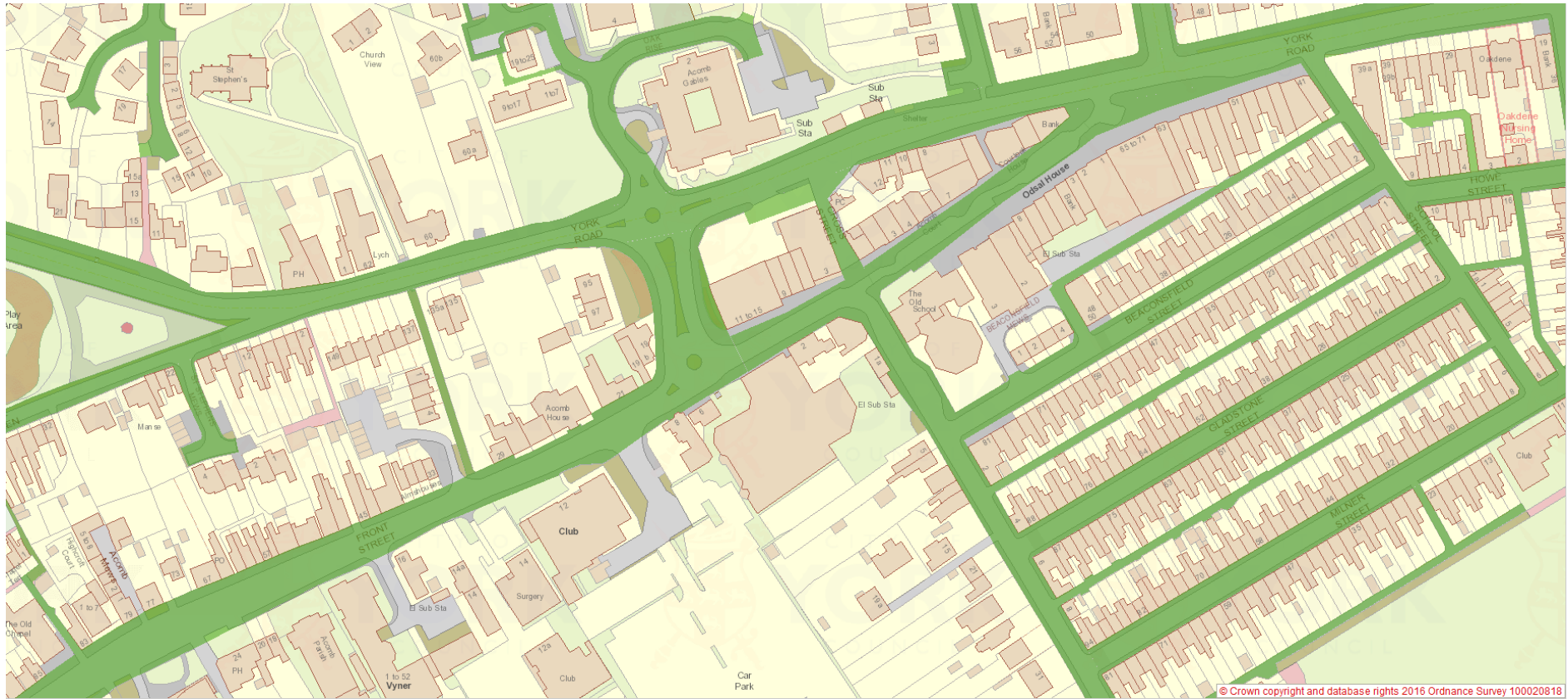
Acomb Front Street Shopping Area – adopted highway shown in green